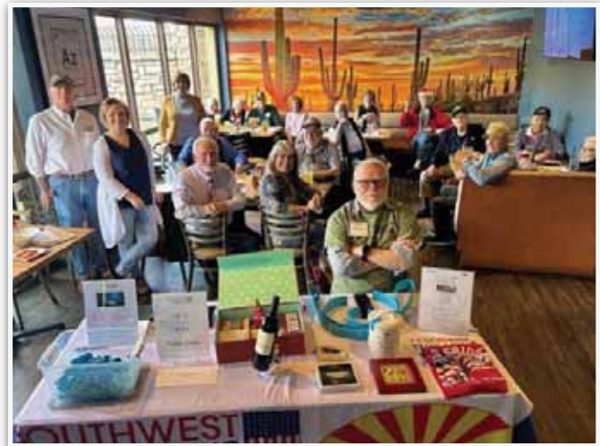
AZMOAA and SWVCC invade Famous 48!

Although Navy won this great rivalry game in an upset, both teams, coaches, and fans showed the character and discipline for which our service academies are known. Unlike the debacle following the Michigan upset over Ohio State, all of us are proud of both teams as they showed why this game is referred to as “America’s Game.” 🌅