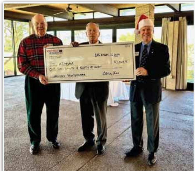
AZMOAA receives their share of the fundraising tally.