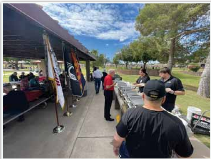
Famous Dave's serves up their delicious BBQ.