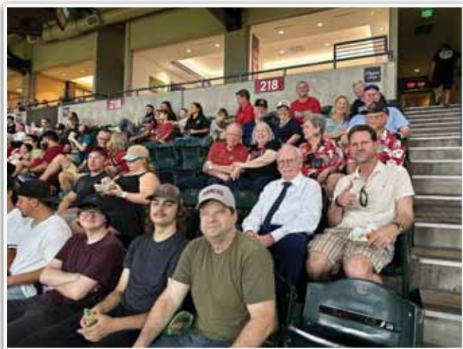
MOAA chapter members attended the Diamondbacks game August 11th against the Phillies. Diamondbacks 12 - Phillies 5. Yay!!