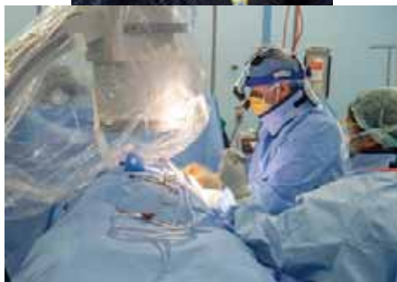
Operating onboard USNS MERCY