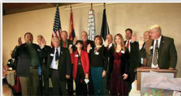
Oath swearing for Officers-Directors 2024