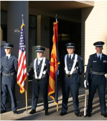
Sandra Day O'Connor High School JROTC Color Guard