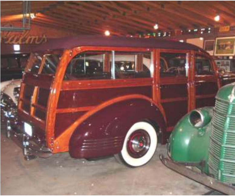
Woody Station Wagon

The May 15, 2004 Luncheon followed the Classic Cars visit and the program consisted of the Scholarship Awards for 2004.