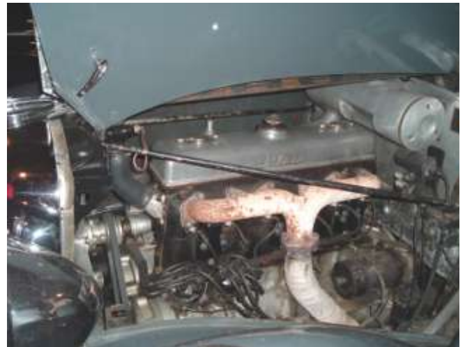
This rare Lagonda has a dual ignition system