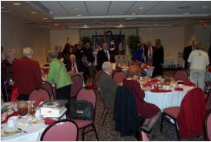
Members enjoying the ambiance of the dinner & auction.